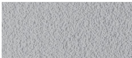
585 SAND COARSE