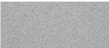
584 SAND FINE