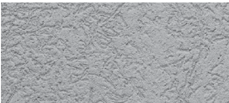
580 SWIRL FINE