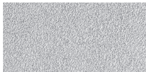
533 SAND SMOOTH